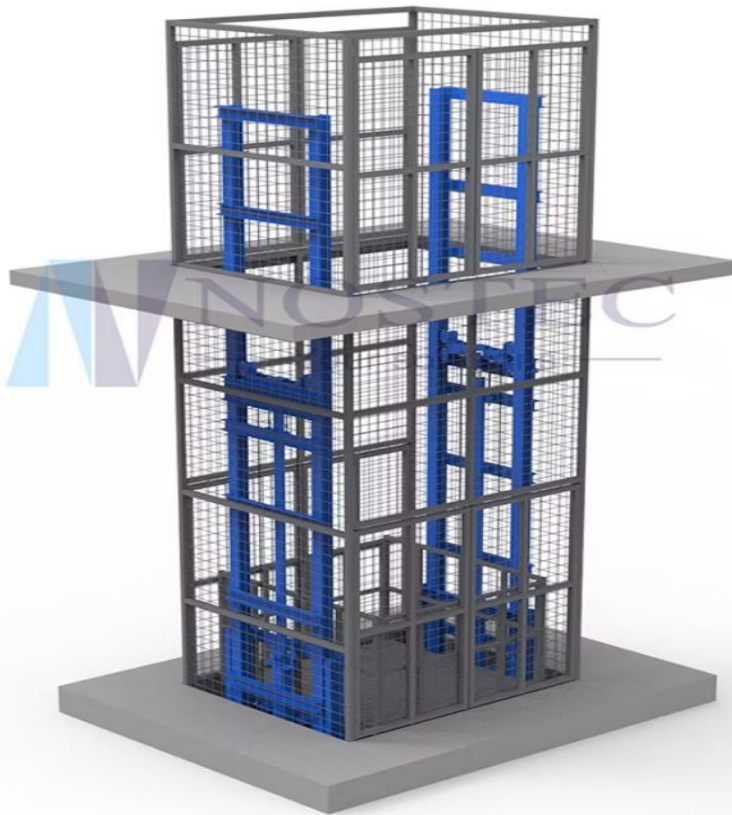
Hydraulic Lift with Mesh Encloser

Hydraulic Elevator :- Hydraulic elevators are commonly use in private homes or residential buildings. In construction sites hydraulic elevators help in lifting construction materials, tools, and other heavy equipment to higher floors