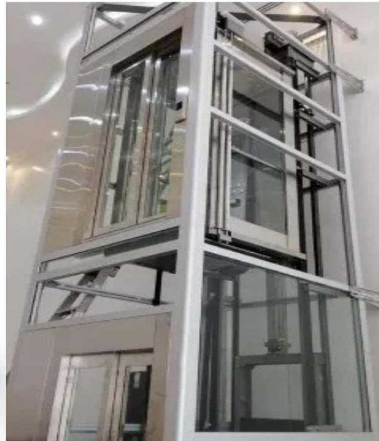
Hydraulic Lift with Tapan Glass Encloser